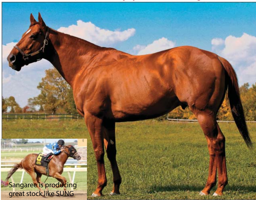
Sangaree is producing great stock like SUNG